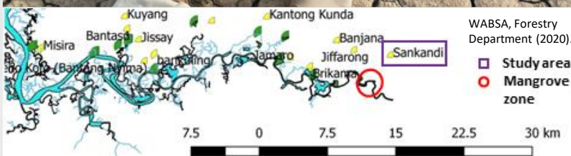
Report on survey on the distribution, identification and suitable sites for mangrove enrichment and restoration in LRR.