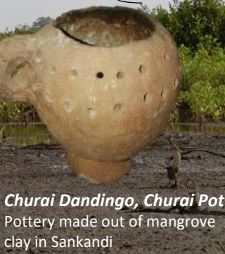
Churay Dandingo, Churay Pot Pottery made out of mangrove clay in Sankandi

Elders of the community sharing their experiences living with mangroves before the dieback 40 years ago. Local awareness raising activities