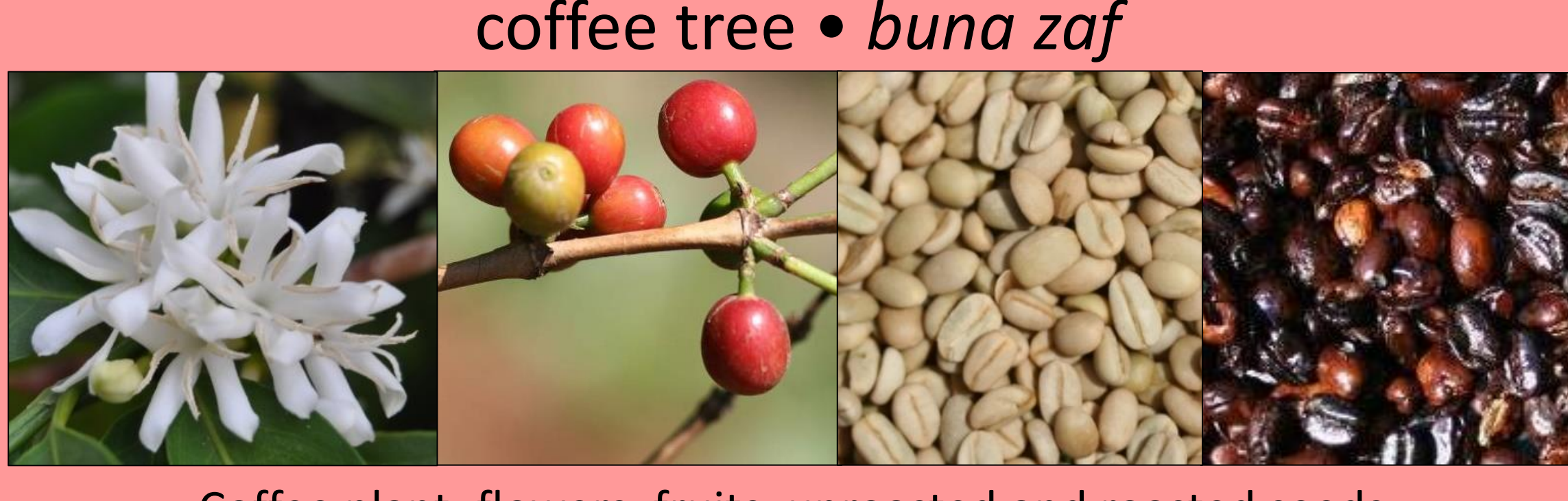
Coffee plant: flowers, fruits, unroasted and roasted seeds