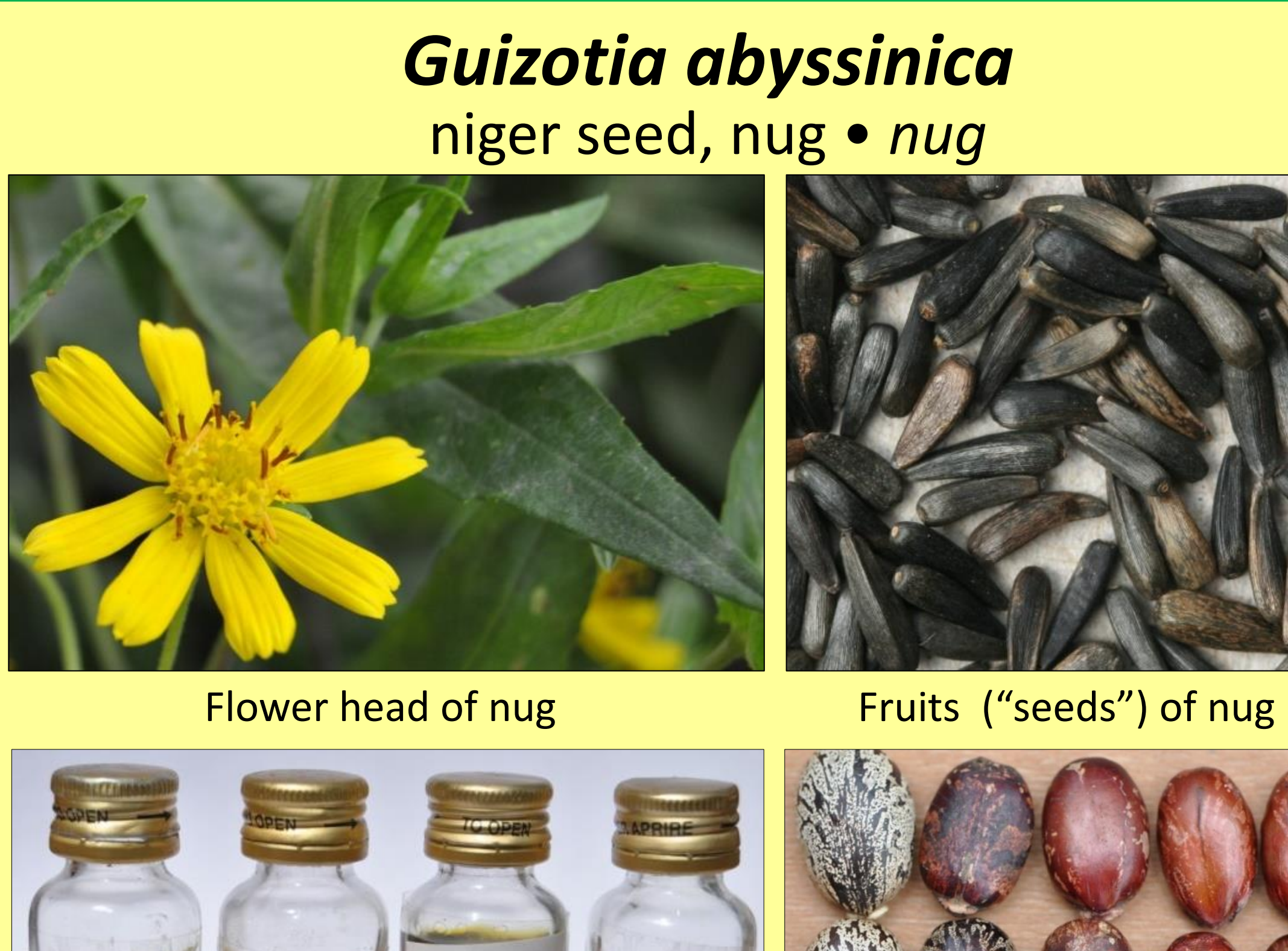
Ethiopian seed oils