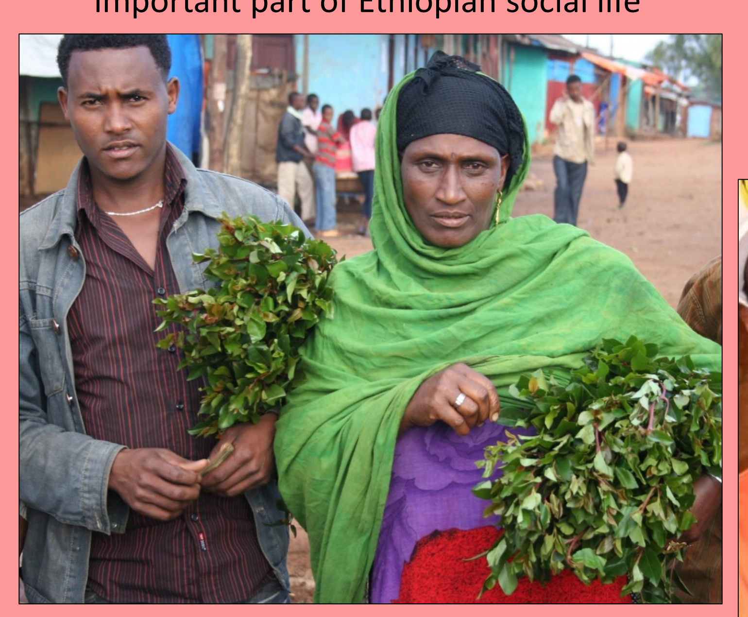
Khat (chat) is a popular and widely used stimulant in Ethiopia.