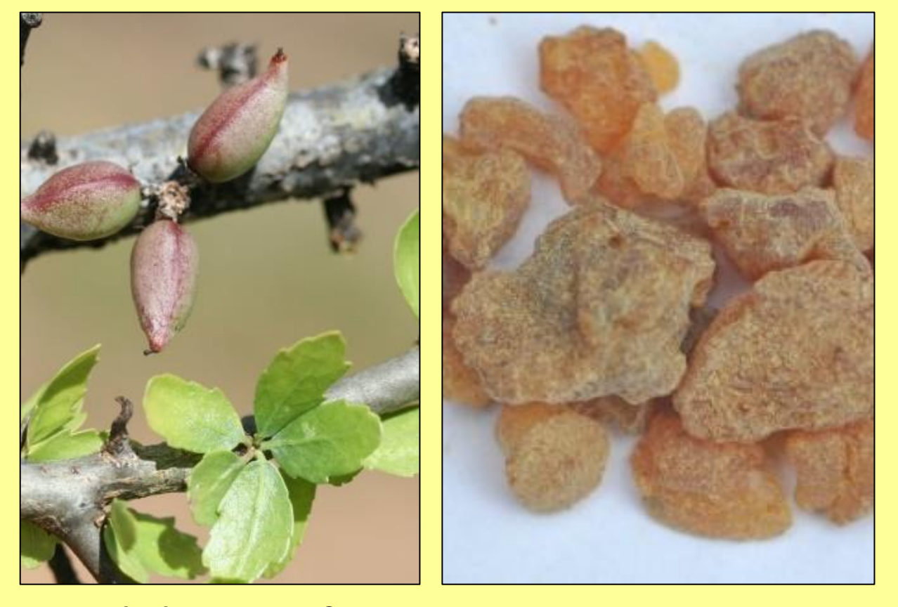
Myrrh leaves, fruits Myrrh