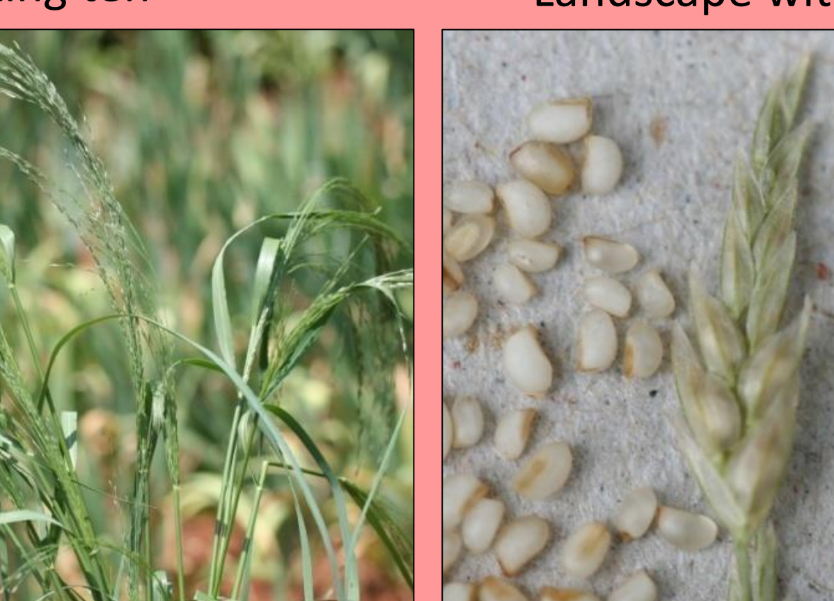
Landscape with teff haystacks