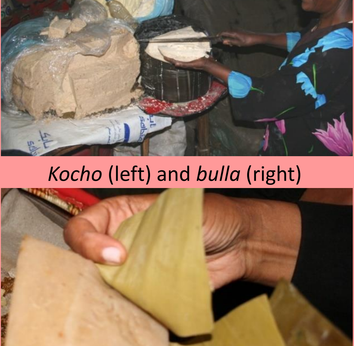
Enset bread made from kocho and bulla